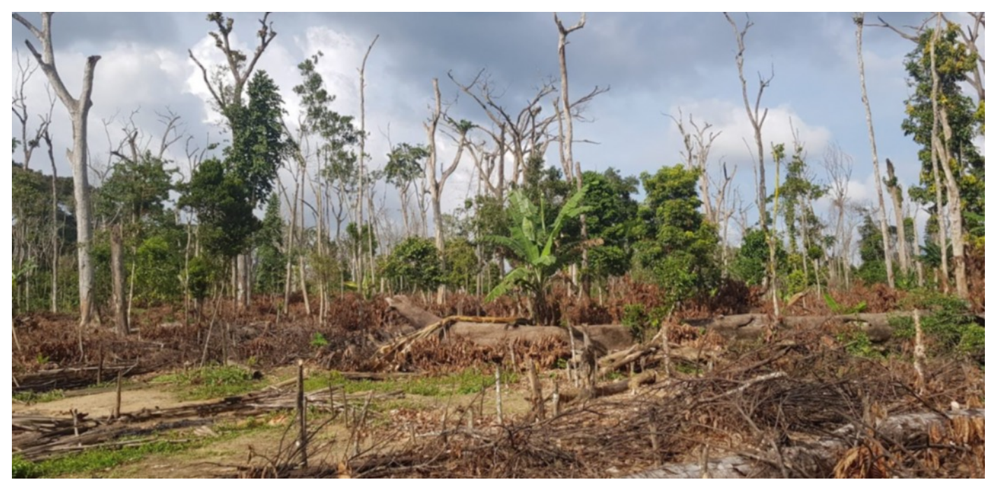
Within days of the first visit, forestry services acted on the discovery and destroyed the cocoa plantation.