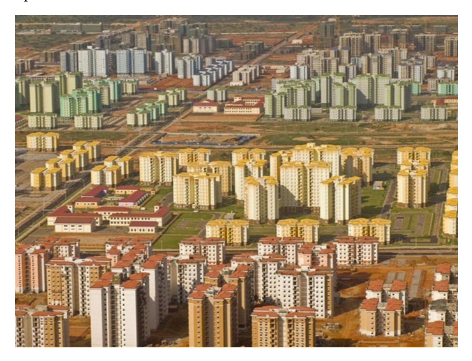
Nova Cidade de Kilamba, Angola,

China's far-sighted strategy has also opened the continent to Chinese goods, which may initially be dumped at a loss, putting African competitors out of business, at which point China can raise the price of its goods. Since the appearance of COVID-19 in China, African social media have featured clips of Africans who work or study in China being beaten or banned from McDonald's<sup>12</sup>, accused of bringing the virus to China. Confronted by an anti-Chinese backlash in Africa, officials are reported to be offended that Africans are ungrateful for the help received from China.