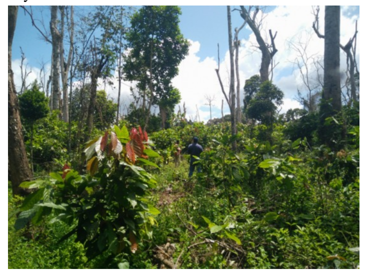
Verification of alerts in Forēt Classée de Cavally, Côte d'Ivoire, allowed forestry services to uncover 10+ hectares of illegal cocoa.

become carbon neutral. This allows corporations such as Microsoft to offset their historic emissions. The proceeds of the sale are then transferred to the forest nations to compensate them for not using the land for short-term economic gains. Emergent's scheme has been underwritten by the Government of Norway as a buyer of last resort.