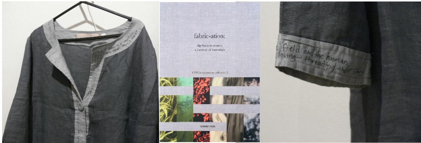
if linen is a vegetable whose mouth does it feed?

There was an open discussion after the performance last February – I did not have the heart to tell them of the misogyny in 16<sup>th</sup> century Dutch silk production in the incubation of the silkworm egg – it's a bit like the myths of the finest Havana cigars.