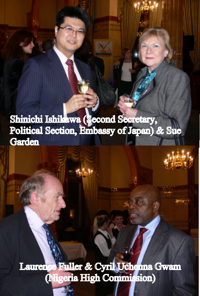
Our thanks to British Influence for their sponsorship of the Reception