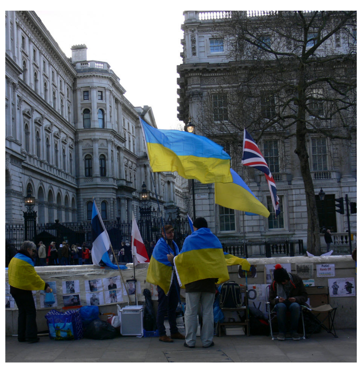
The Ukrainian Vigil opposite Downing Street. Inside: Ukraine: North Korea: Taiwan.

Journal of the Liberal International British Group