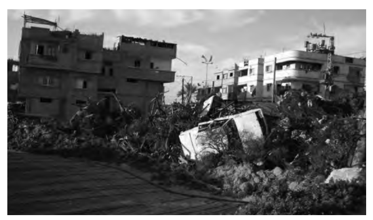
Israeli destruction, but a field is being re-cultivated from the desolation

engage. I shall never forget the haunting look in their eyes, as if they had seen things no child should ever see.