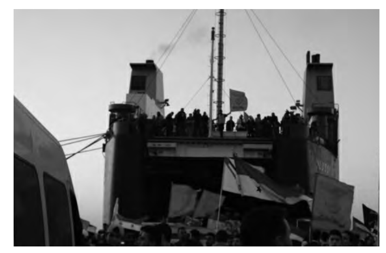
Loading the convoy onto the ferry at Lattakia, Syria

At the Jordan border however, the atmosphere changed. Jordan is a buffer zone with Israel, and it was quite clear that the Jordan authorities did not welcome our presence. We were held for hours waiting