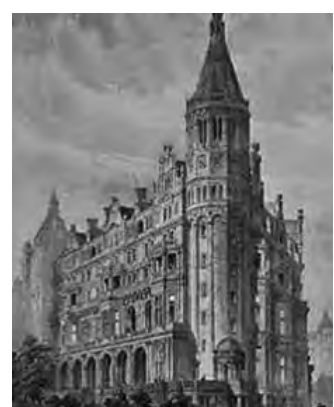
London SW1A 2HE www.nlc.org.uk

events for its members, both political and social. It is situated in Central Westminster, overlooking the Thames and offers luncheon,