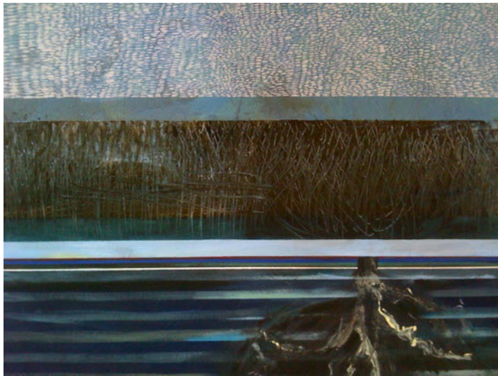
"From Blight to Light" Lucy Brennan Shiel

Brennan Shiel's poetic landscapes have a deep melancholic resonance, she guides our attention to the shared collective violation, to the oppressed and