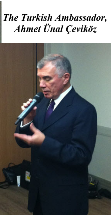
The Turkish Ambassador, Ahmet Ünal Çeviköz