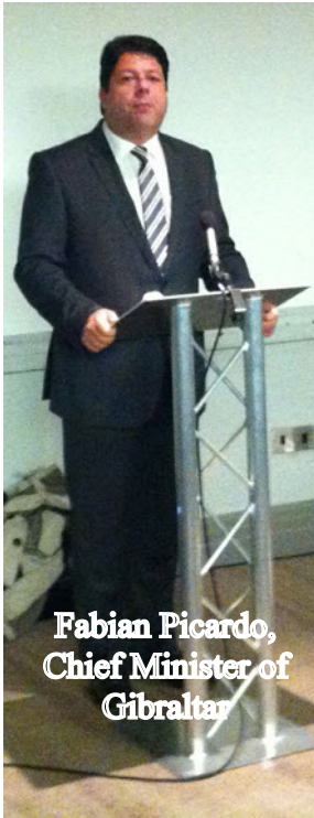
Fabian Picardo, Chief Minister of Gibraltar