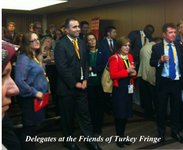
Delegates at the Friends of Turkey Fringe