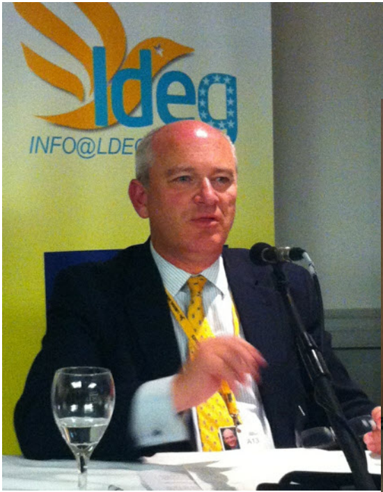
Nick Harvey at the LIBG Fringe