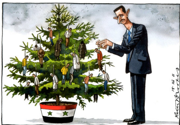
President Assad of Syria continues to slaughter his own people.