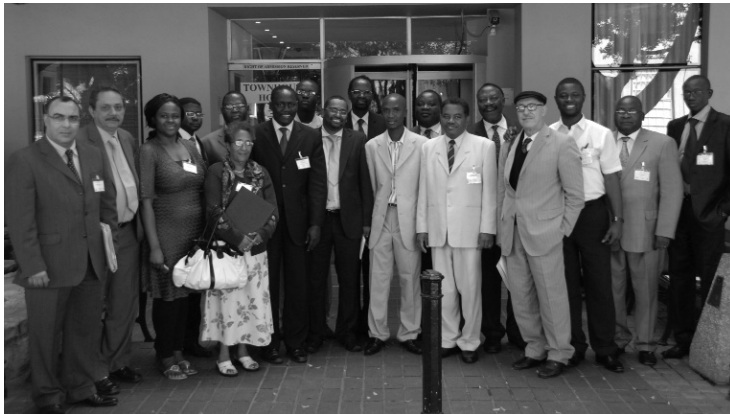
Africa Liberal Network delegates

H elen Zille, leader of the Democratic Alliance, the official opposition in South Africa, former mayor of Cape Town and current premier of the Western Cape, welcomed over 110 liberals from all over the world to the 185th Executive Committee of Liberal International.